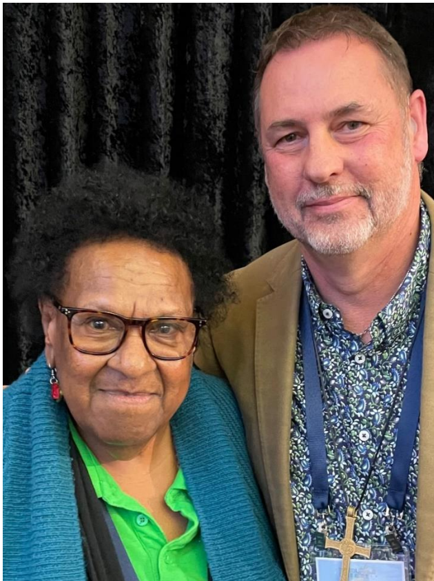
Photo: Parishioners at Holy Trinity Launceston raising funds for ABM.

We could certainly not do what we do without you.